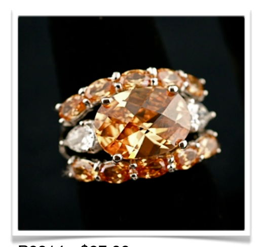
R0914 - $97.00 16mm cubic zirconia and sterling silver.