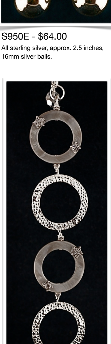
S954B - $103.00 7 inches extends to 8, 32mm Mother of Pearl discs and 38mm doted sterling silver discs.