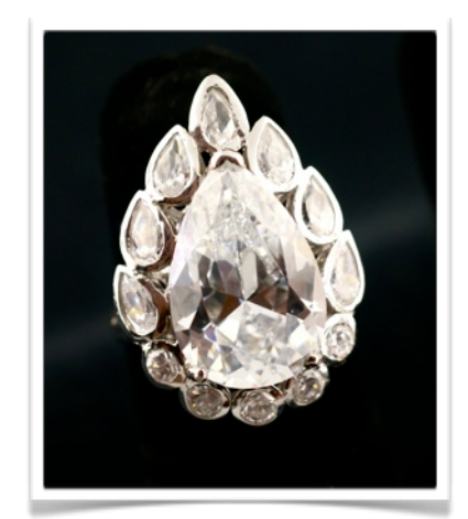
R0910 - $99.00 20mm cubic zirconia and sterling silver. Sizes: 6.5, 7, 7.5, 8.