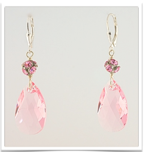
S981E - $53.00

22mm Swarovski tears with 5mm crystal fireballs. Sterling silver lever backs.