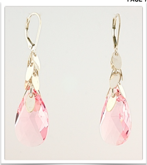
S980E - $55.00

Colours: Pink (shown), lt. smoke, aqua, purple, clear and lt. topaz.