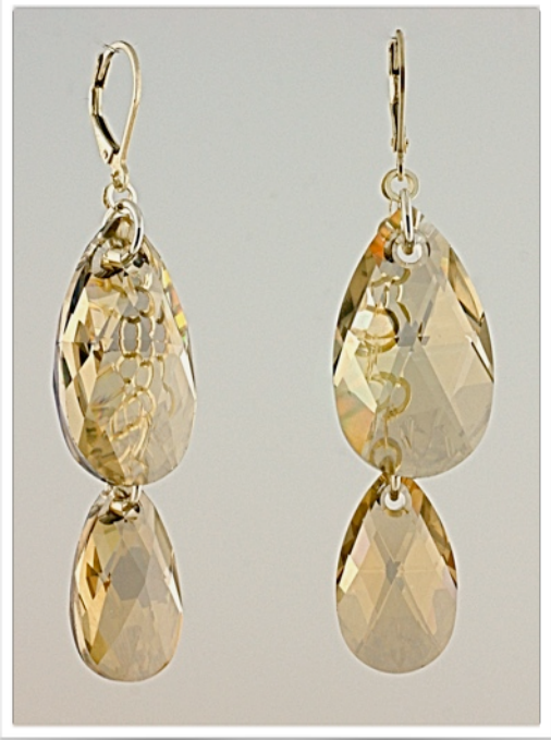
S965E - $75.00

Approx 1.5 inches, 14mm and 18mm Swarovski crystals. Colours: It. smoke (shown), clear, clear ab and It. topaz.