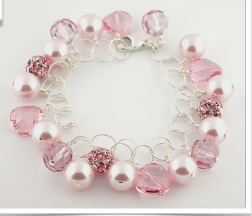
S9479B - $119.00

Approx. 56 inches, sterling silver chain, 8mm and 12mm swarovski crystals, pink jade semi-precious stones and crystal flower accents.