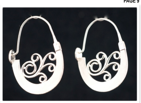
S944E - $70.00

Approx. 1 inch, brushed sterling silver.