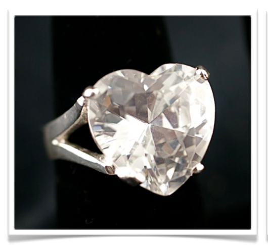
R0911 - $90.00 20mm cubic zirconia and sterling silver. Sizes: 6, 7, 8, 9.