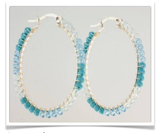
S921E - $70.00

Colours: Blue opal(shown), Pink dyed turquoise.