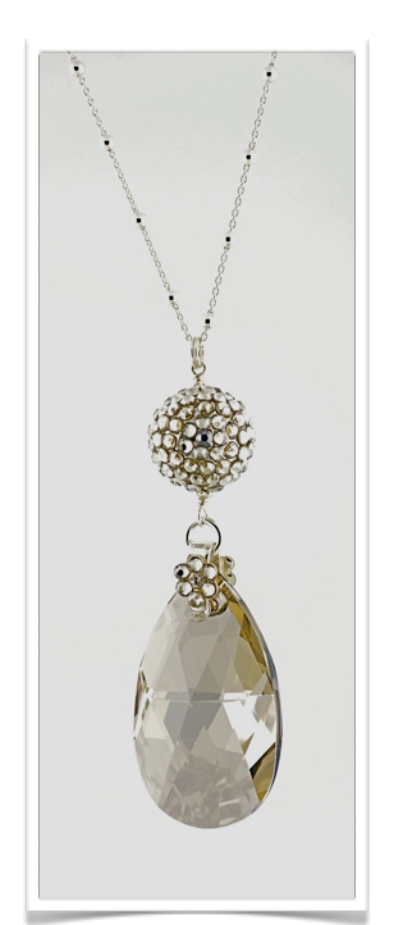
S929N - $154.00 - LONG

Colours: Lt. smoke (shown), Clear, lt. topaz and grey.