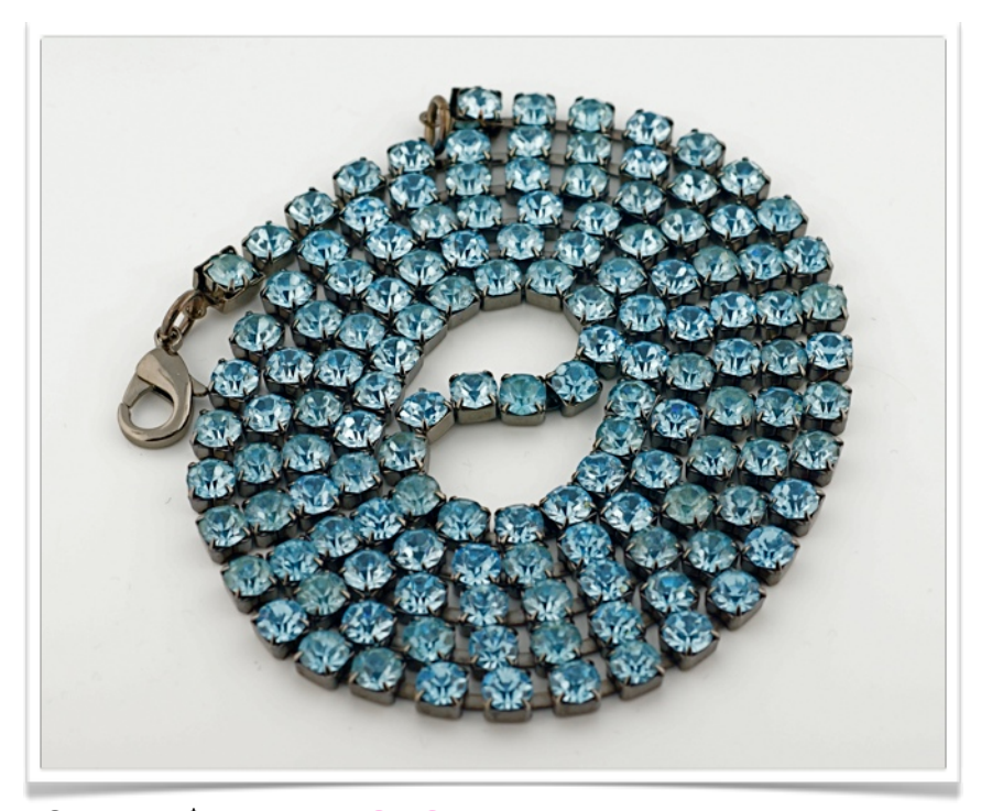
S933N - $149.00 - LONG

Colours: Pink (shown), It. smoke and It. topaz, clear, clear ab, purple and aqua.