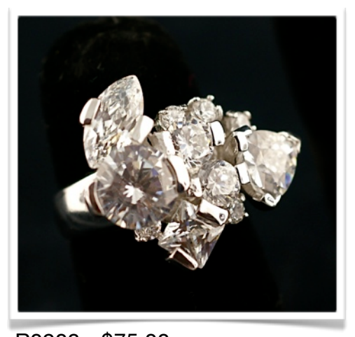
R0908 - $75.00 Cubic Zirconia and sterling silver. Clear Sizes: 6, 7, 8, 9. Pink Sizes: 6, 7, 8.