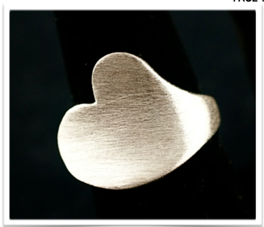
R0903 - $42.00 Brushed sterling silver. Sizes: 6, 7, 8, 9.