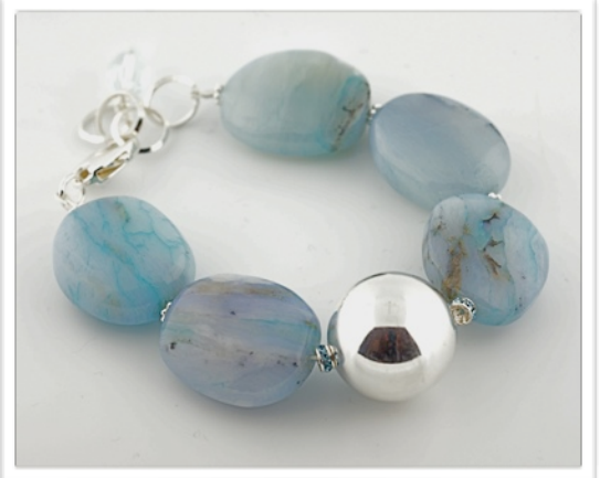
S989BN - $99.00

10 mm round silver ball stud earrings with BEAUTIFUL! 16mm genuine top quality turquoise beads.