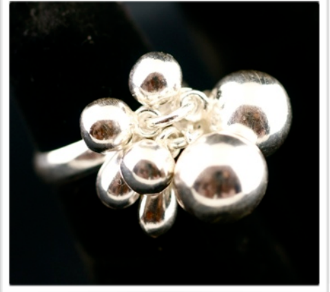
R0905 - $46.00 High polished sterling silver.