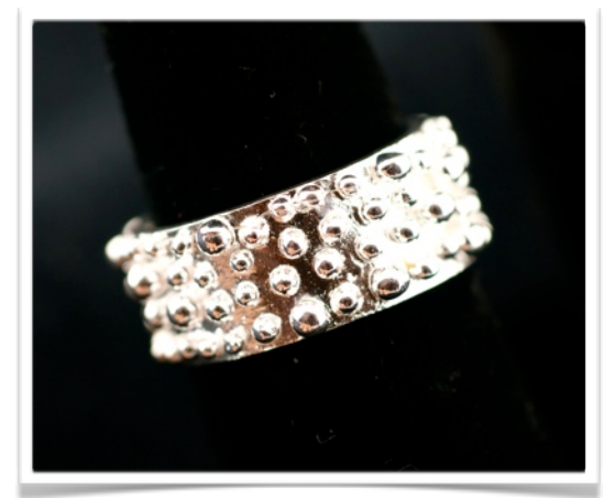
R0906 - $57.00 High polished sterling silver. Sizes: 6, 7, 8, 9.