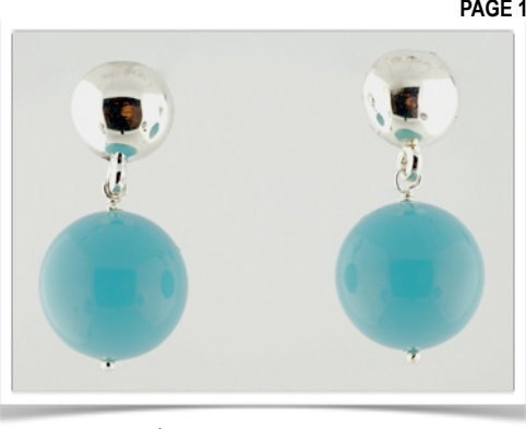
S985E - $44.00

7 inches extends to 8. 28mm by 40mm sterling silver oval, 12mm crystal fireballs, BEAUTIFUL! 16mm genuine top quality turquoise beads.