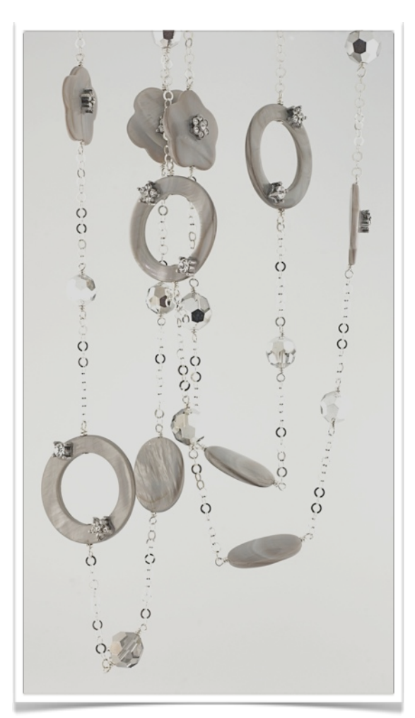
S953N - $154.00 - LONG

30 inches designer sterling silver ball chain with a 24mm large silver bell ball.