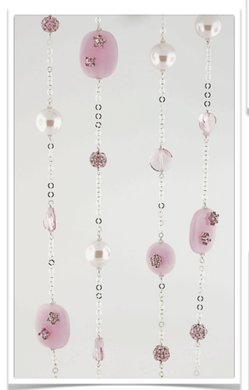
S982N - $154.00 - LONG

Approx. 56 inches, sterling silver chain, 8mm and 12mm Swarovski crystals, coral semi-precious stones and crystal flower accents.