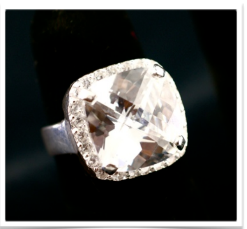
R0912 - $66.00 16mm cubic zirconia and sterling silver. Sizes: 6, 7, 8, 9.