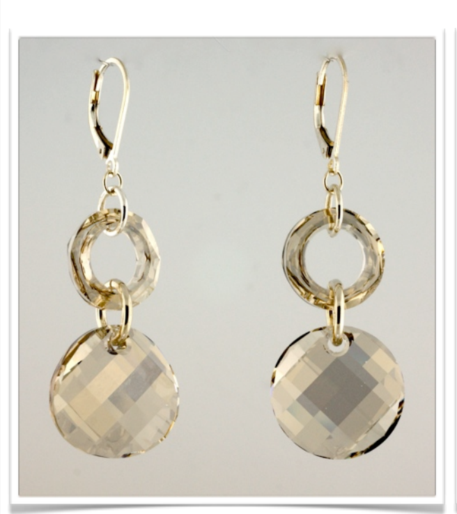
S966E - $70.00

Approx 1.5 inches, 14mm and 18mm Swarovski crystals. Colours: It. smoke (shown), clear, clear ab and It. topaz.