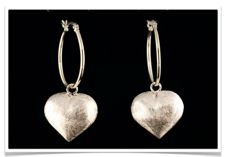
S945E - $75.00

Approx. 1 inch, brushed sterling silver.