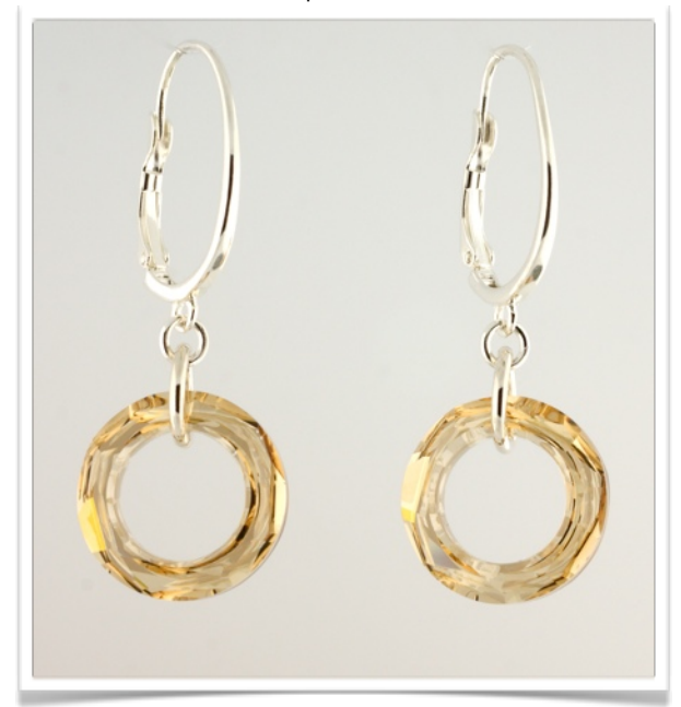
S940E - $88.00

Colours: Lt topaz (shown), mirror and clear.