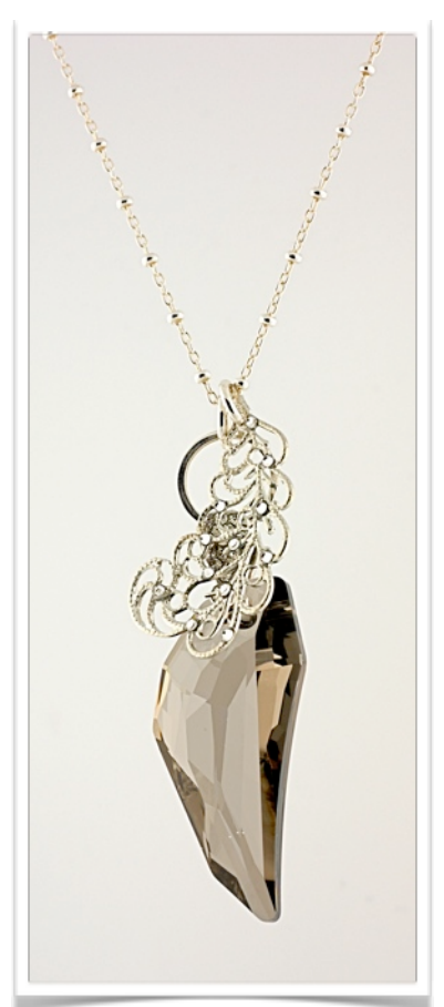
S962N - $128.00 - LONG

30 inch designer sterling silver chain with the new 40mm "Pegusus" Swarovski crystal and silver plated leaf charm.