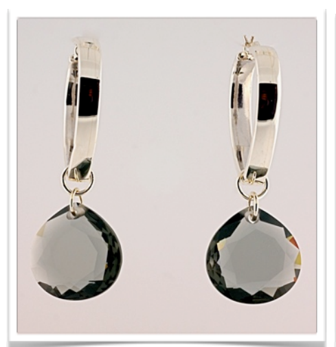
S957E - $75.00

Approx. 1 inch tear shaped hoops with 16mm diamond cut crystal tears.