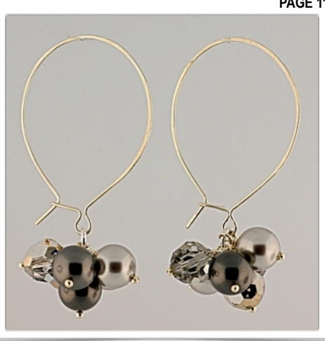
S960E - $48.00

Colours: Drk. grey (shown), topaz, pink, clear and white pearl