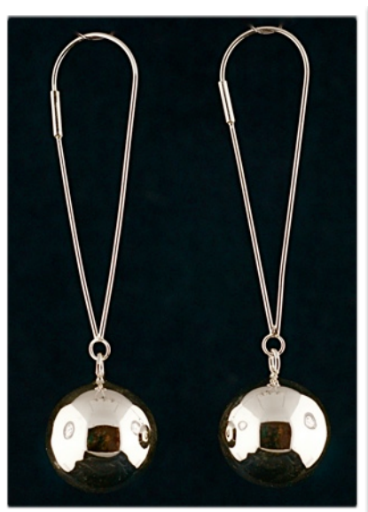
All sterling silver, approx. 2.5 inches,