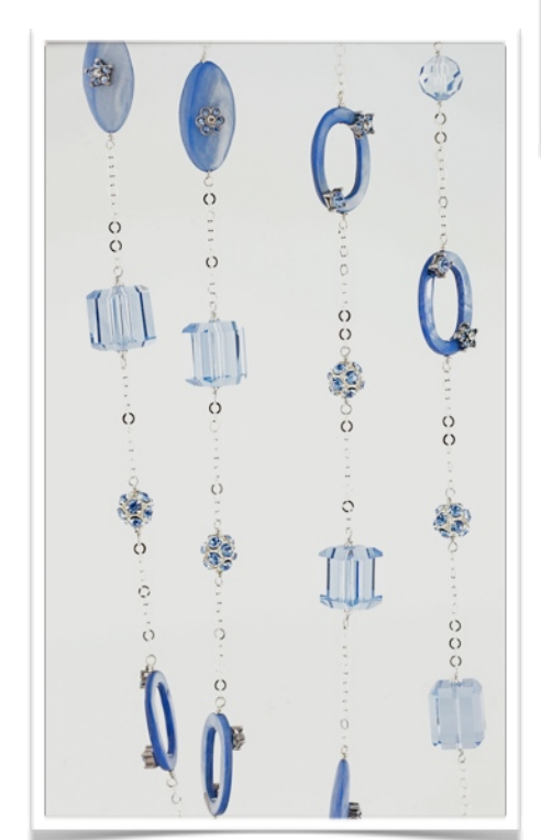
S992N - $172.00 - LONG

Approx. 56 inches, sterling silver chain, 10mm swarovski crystals,12mm crystal fireballs, BEAUTIFUL! 16mm genuine top quality turquoise beads and 18mm aventurine semiprecious beads.