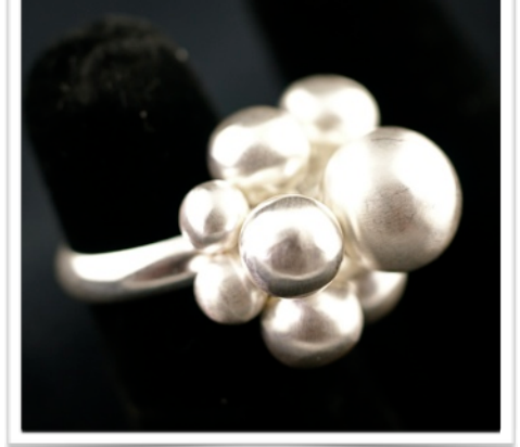
R0904 - $75.00 Brushed sterling silver. Sizes: 6, 7, 8, 9.