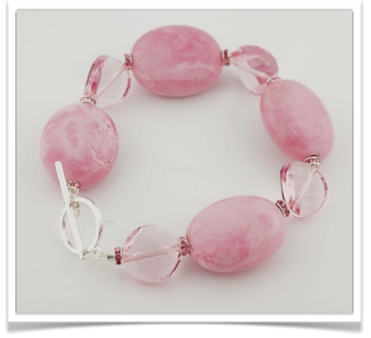
S974B - $84.00

Colours: Pink (shown), Clear and pearl, It. topaz, purple, It and drk grey.