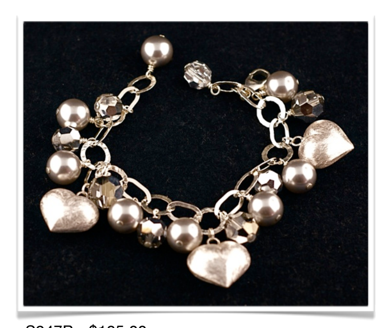
S947B - $185.00

Approx. 1.5 iches, 18mm sterling silver brushed silver hearts.