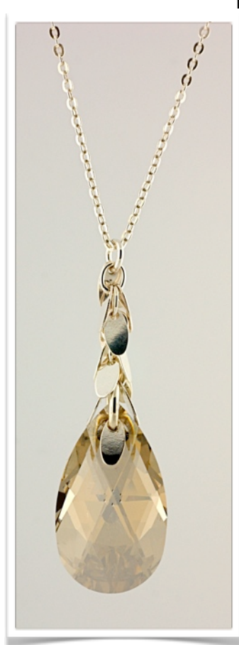
S963N - $58.00

Colours: Lt. smoke (shown), Clear and lt. topaz.