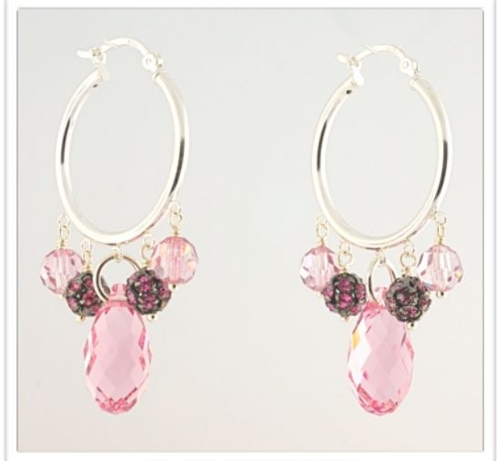
S968E - $75.00

Colours: Pink (shown), It. smoke and It. topaz.