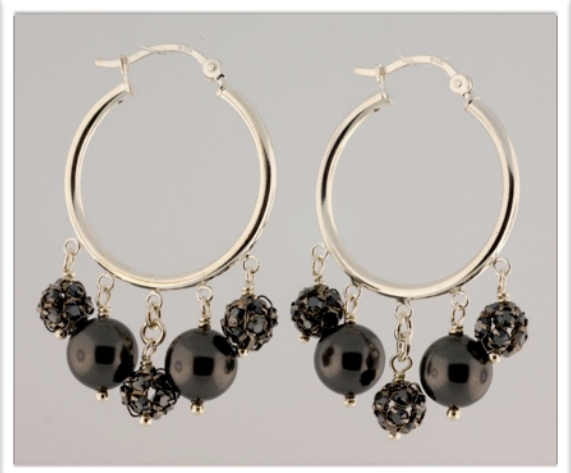
S959E - $70.00

Colours: Grey (shown), Clear, It. yellow, Iilac, black, pink, navy, peridot, It. blue and topaz.