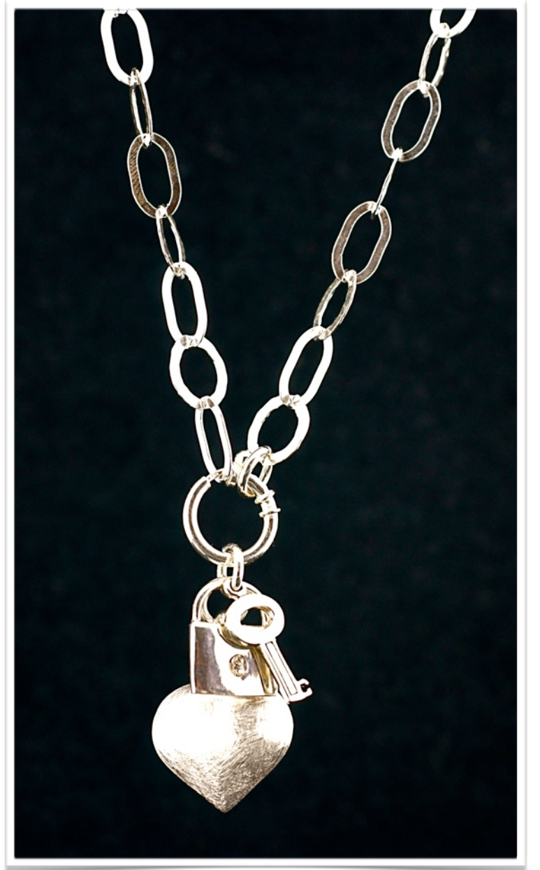
S946N - $172.00

All sterling silver, adjusts to 8 inches, 18mm brushed silver hearts, Swarovski pearls and Preciosa crystals.