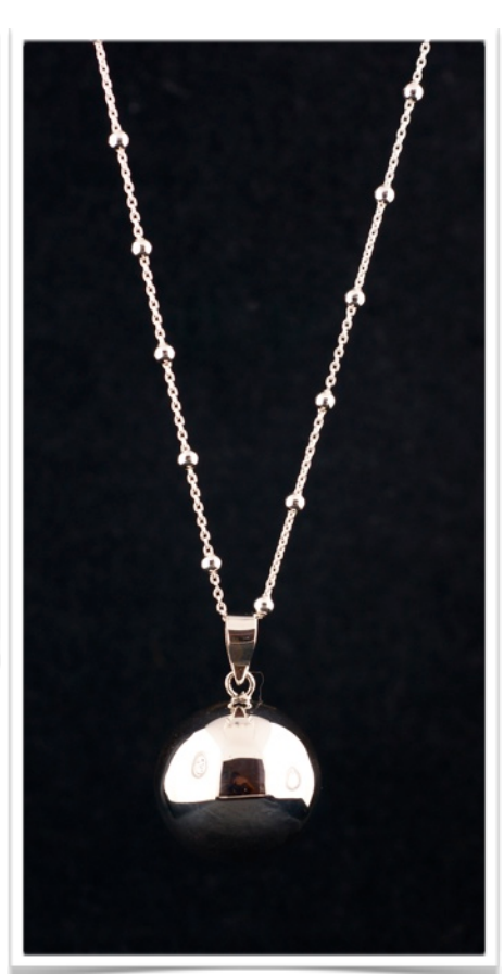
S955N - $101.00 - LONG

30 inch designer sterling silver chain with a 38mm doted disc with a 40mm Russian Labradorlite stone with crystal accents.