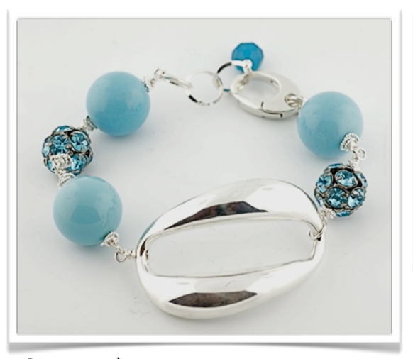
S986B - $136.00

Approx. 56 inches, sterling silver chain, 18mm rectangle crystals, 16mm shell open and closed ovals, 10mm crystal fireballs and 12mm Swarovski crystals.