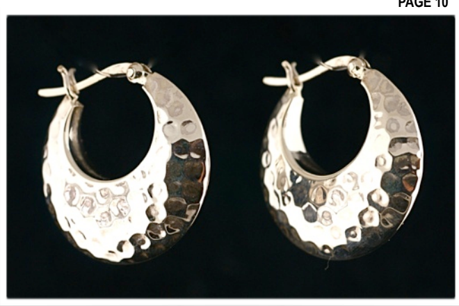
SA902E - $62.00 Hammered sterling silver, approx. 1 inch.

30 inch designer sterling silver chain with a 38mm doted disc with a 40mm Russian Labradorlite stone with crystal accents.