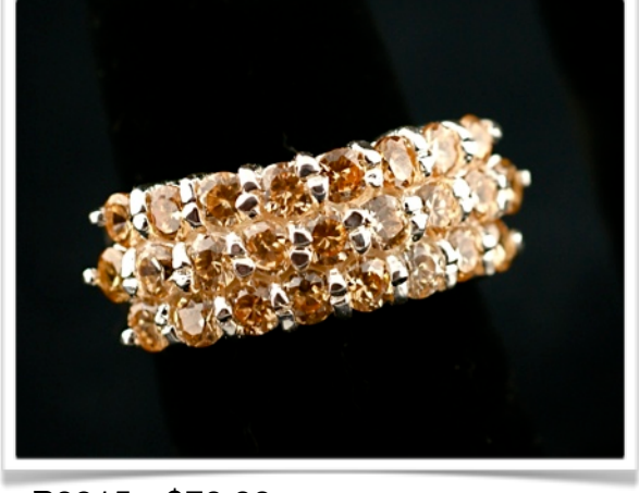
R0915 - $70.00 20mm cubic zirconia and sterling silver. Topaz Sizes: 7.