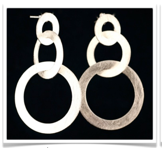
S942E - $70.00

Approx. 1.5 inches, brushed sterling silver.