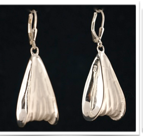
S943E - $68.00

Approx. 1.5 inches, brushed sterling silver.