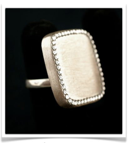
R0902 - $53.00 Brushed sterling silver with a rim of clear Swarovski crystals, surface is approx 1.5 x 1.5 inches