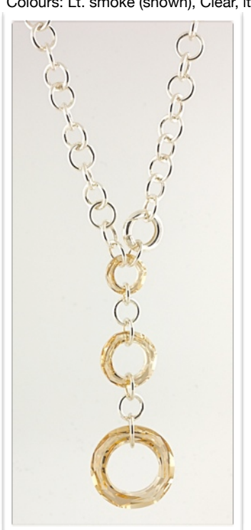
S970N - $224.00

Colours: Lt. smoke (shown), clear, clear ab and lt. topaz.