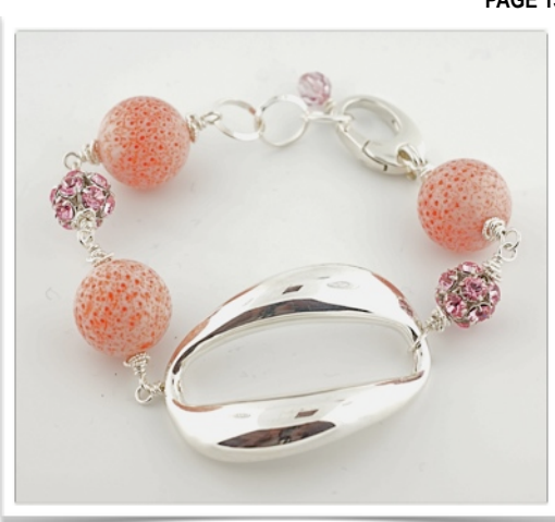
S972B - $128.00

7 inches extends to 8. Sterling silver findings with 18mm pink aventurine beads and 12mm coral beads, with 5mm Swarovski roundellles. All semi-precious.