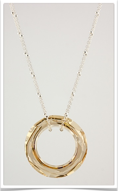
S969N - $90.00

Colours: Lt. topaz (shown), mirror, clear.